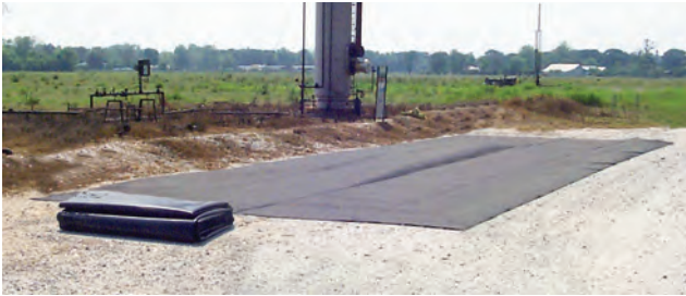
Ground Matting/Track Guard